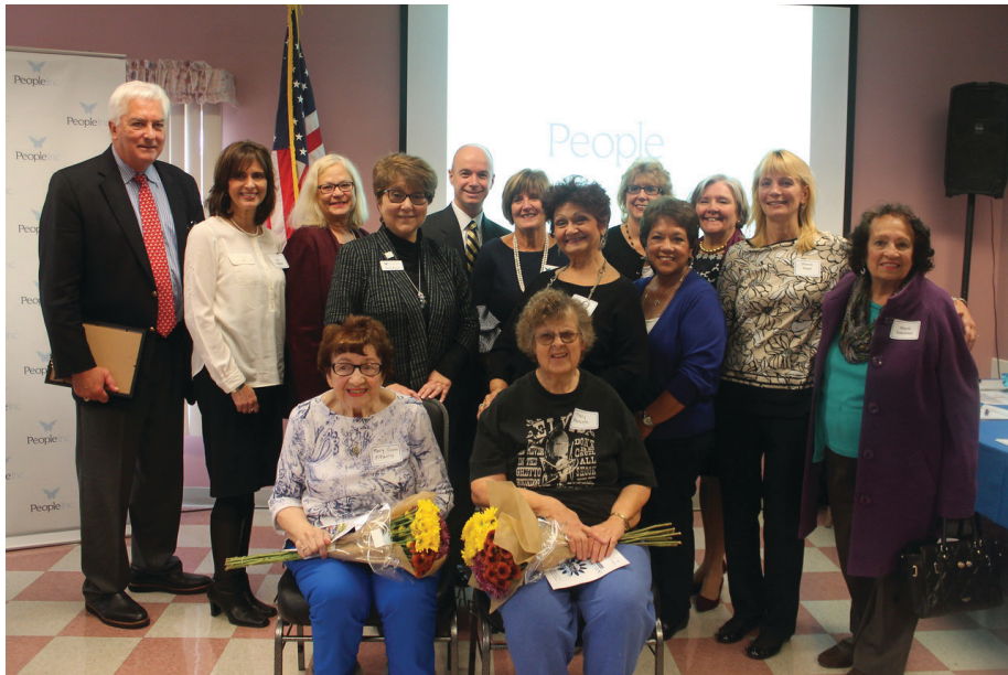
Community leaders, tenants, and staff celebrated the 25th anniversary of People Inc. Senior Living

older adults. As people age, their needs change and services available to them become limited or difficult to access. Recognizing this, along with an increased number of seniors in its neighborhoods, People Inc. broadened its scope as a human service agency to include not only services for individuals with developmental disabilities and their families, but also older adults in need of affordable and safe housing.