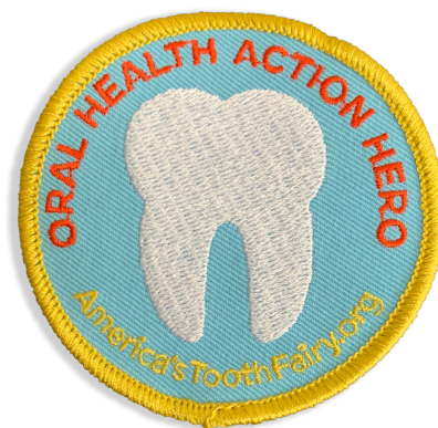
Scout Patch shown smaller than actual size (3" x 3")

America's ToothFairy has additional resources to assist your projects. Visit AmericasToothFairy.org to learn more about how to apply for a Community Education Kit and to download educational materials and activity sheets.