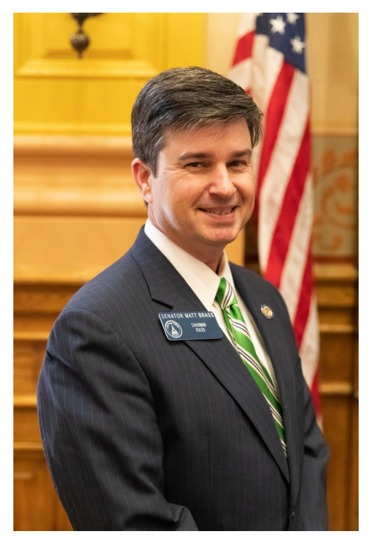
Senator Matt Brass Senate District 28