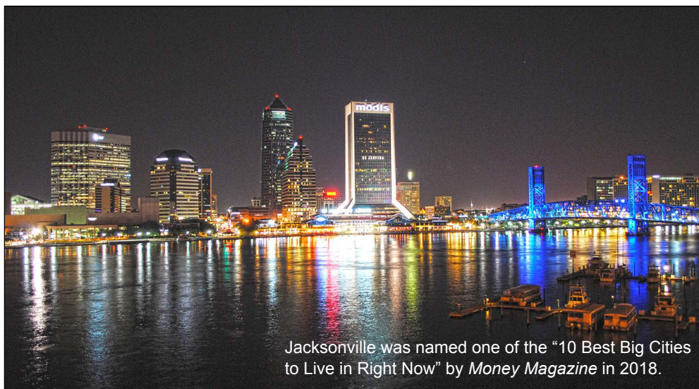
Jacksonville was named one of the "10 Best Big Cities to Live in Right Now" by Money Magazine in 2018.

excellent health care services, and an international airport are available. With restaurants, shops, entertainment, museums, parks, arts, music, and professional sports, this city offers it all.