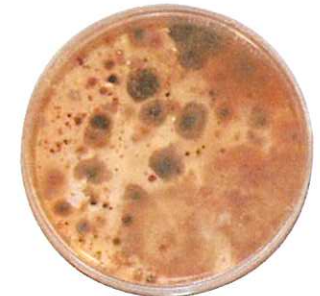
Before ActivePure ® Technology