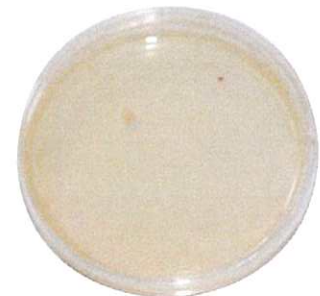
After 8 hours with ActivePure ® Technology

Before and after laboratory tests showing reductions of airborne contaminants with ActivePure ® Technology.