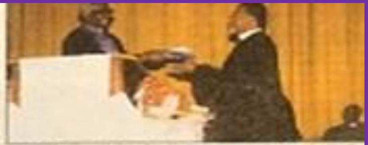
through 4 is, hear arrest is himp dated to linguish measure pity of more than through