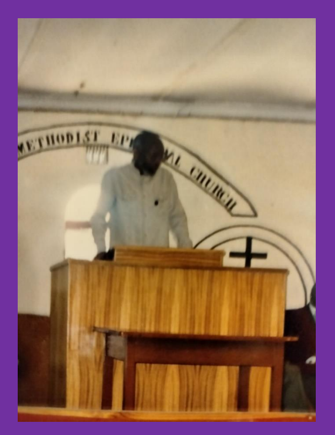
King Moshoeshoe, II, of Lesoto gereeting the 1994 tour