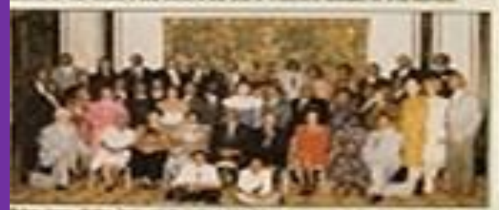
there share white how of its own to be block to be been been and the starting has