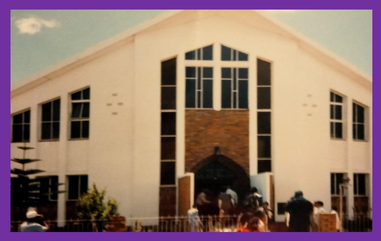
Zion AMEC exterior