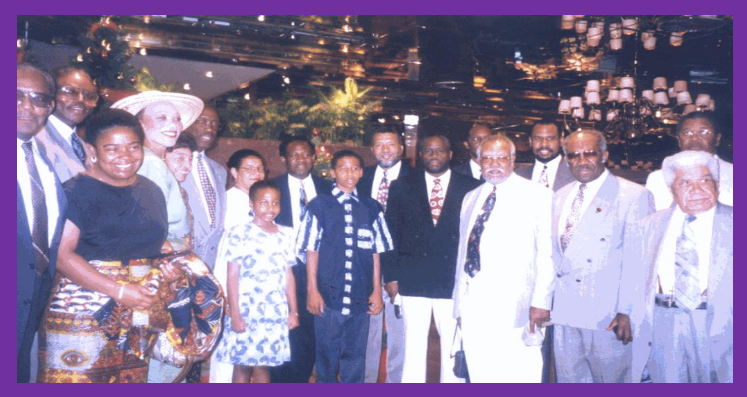
A small tour group picture taken in the lobby of the Carlton Hotel, Johannesburg RSA, 19<sup>th</sup> District