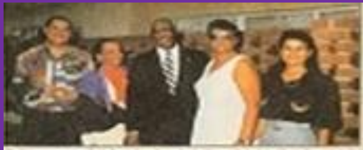
The Dissipants panel is "Table Roy is Tops, "some finants allows and the Salker Topic Research in the

The James Tours to South Africa Forges History, Hope and Triumph, 1994 and 1995