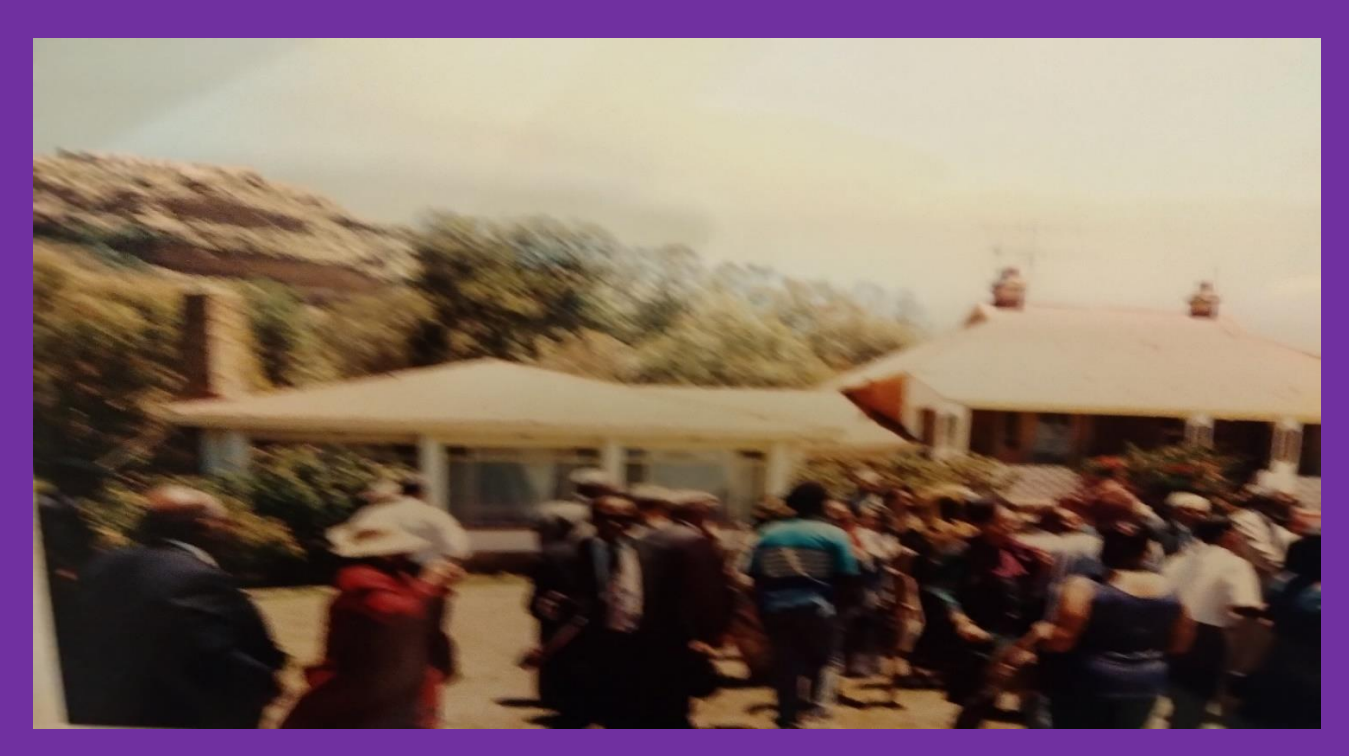
Visiting the home of King Moshoeshoe