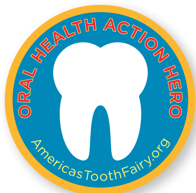
Scout Patch design shown actual size (2" x 2")

To earn a patch, demonstrate that you have led three oral health projects that change the way we think about taking care of our mouths, empower children to change negative oral health behaviors, and remove barriers that challenge positive oral health habits.