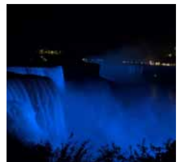
On Friday, August 14, 2020, several local landmarks were illuminated blue in honor of the 50th anniversary of People Inc., including Niagara Falls, NY.

Learn more about our history and milestones: people-inc.org/tellingourstory