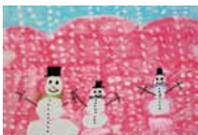
Snowmen in Pink