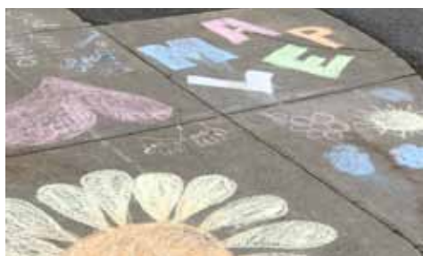
Cheerful chalk drawings from people living at one of our group homes in Williamsville, NY.