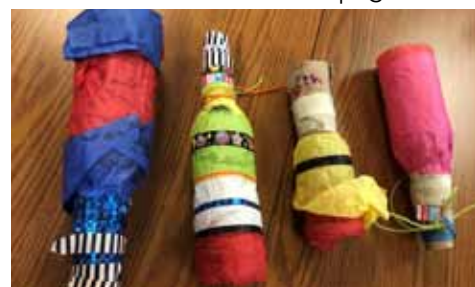
Festive Cinco de Mayo shakers, created by people from one of our group homes in West Seneca, NY.

"Do your little bit of good where you are; it's those little bits of good put together that overwhelm the world." ~ Desmond Tutu