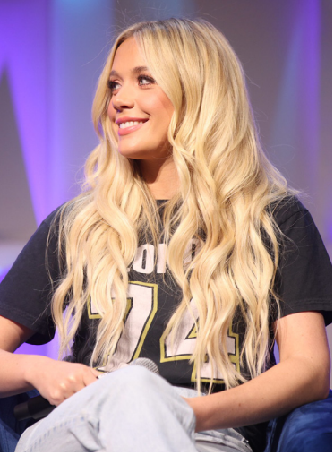
Megan Moroney was the central figure in a March 1 "Cycle of a Song" panel about her debut hit, "Tennessee Orange."