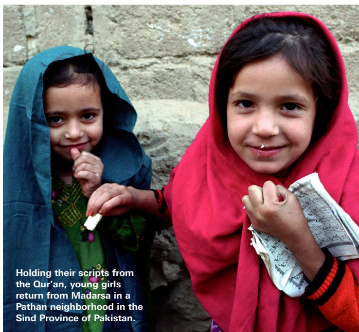
Holding their scripts from the Qur'an, young girls return from Madarsa in a Pathan neighborhood in the Sindh Province of Pakistan.