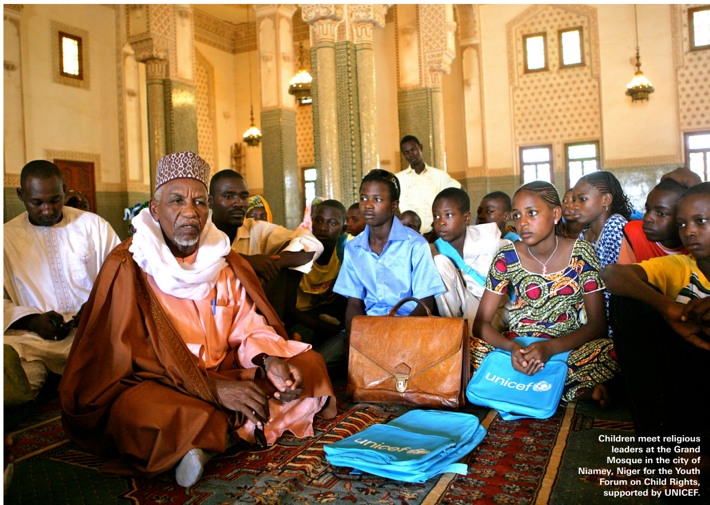
Children meet religious leaders at the Grand Mosque in the city of Niamey, Niger for the Youth Forum on Child Rights, supported by UNICEF.

Jewish tradition is rooted in the concepts of tzedakah and chesed . These overarching values of generosity and compassion form the foundation of Jewish teachings on social justice, while the remembered journey to freedom from slavery helps establish the foundation of Jewish empathy for the most vulnerable. The Torah instructs Jews to "protect the stranger" and end oppression, while the rabbis of the Talmud emphasize that redeeming captives is one of God's greatest commandments, as they