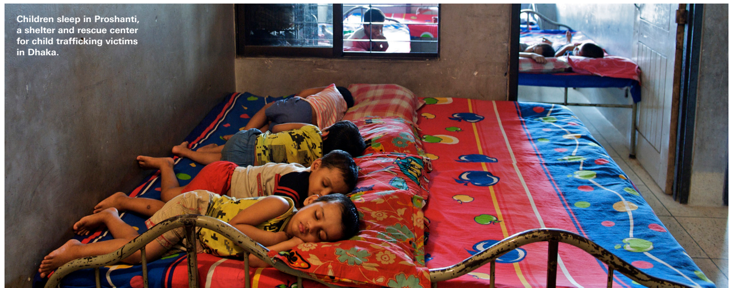
Children sleep in Proshanti, a shelter and rescue center for child trafficking victims in Dhaka.

2 A "child" is considered any person under the age of 18.