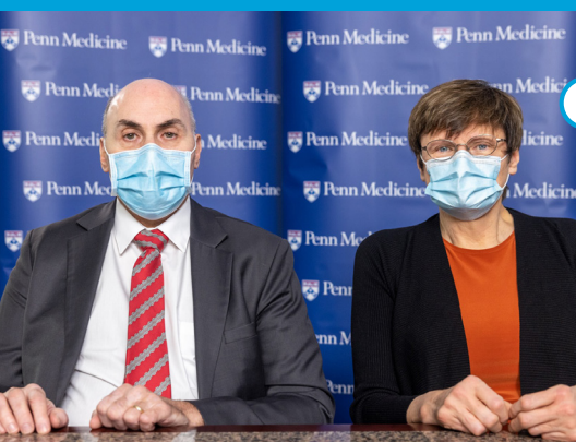
Drew Weissman, MD, Ph.D. Katalin Karikó, Ph.D.