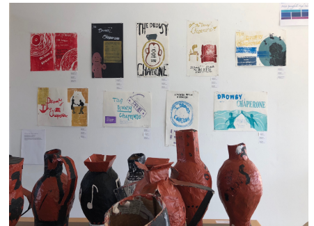
West Springfield High linoprints and JFK, Northampton papier mâché Greek vases