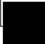
Vacant Grants/Contracts Specialist