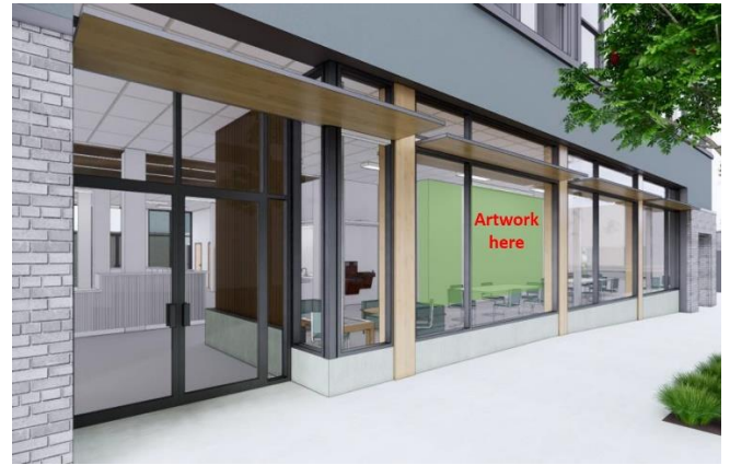
Rendering of main entrance and storefront windows facing SW Park Ave